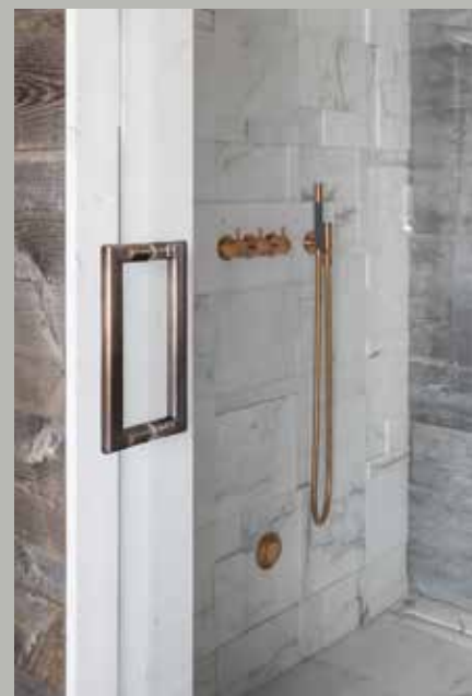
CLOCKWISE, FROM LEFT: A window next to the reclaimed-wood door at the entry courtyard offers a glimpse of the views awaiting inside. • The primary bedroom opens up to the same views as the living room, dining area, and kitchen. • Simple and stunning, this shower is defined by a neutral board-formed concrete palette.

She called on Rain Houser, co-owner of Urbaine Home in Bozeman, Montana, to help secure a number of