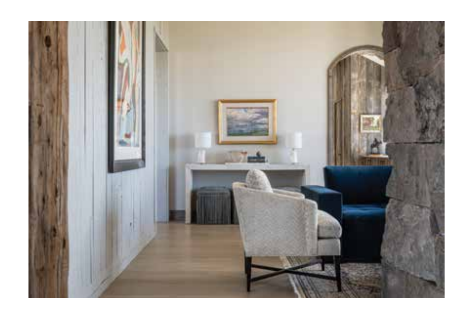
FROM TOP: Furniture and other decor items were selected to complement the homeowners' existing art collection and add a contemporary edge. Designer Melina Datsopoulos, owner of the Missoula, Montana-based Trappings Studio, assisted in selecting the finishing interior details. • A comfortable and functional kitchen with views of the surrounding landscape was important to homeowner Melodee Hanes. "We love good food, good wine, I love to cook, and we love to have our family around when we do that," she says. "I call it 'Houston control."

The lot is nestled in the foothills of the Bridger Mountains outside of Bozeman, within view of four other mountain ranges. A conservation easement to the north ensures that the adjacent land will remain undeveloped. And despite the looming mountains, the landscape evokes a different inherent characteristic for design principal Paul Bertelli.