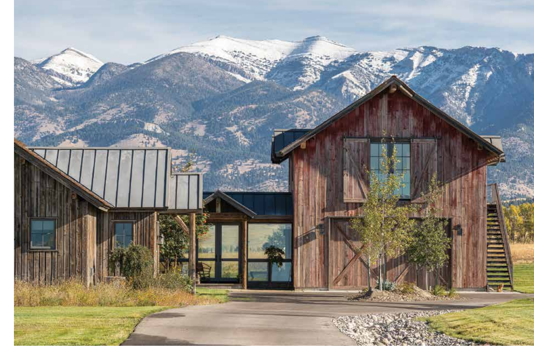
The red barn, crafted from reclaimed wood, references the architectural history of the valley and conceals an apartment and garage. The boards were strategically placed to look as if they had aged over the decades. The barn is connected to the home by a glass breezeway, referencing the transition from old to new.

"When walking the site, it was quite rural. And for our environment, it was less mountain-oriented and more prairie-oriented," the president and senior designer at JLF Architects explains. "The views were virtually 360 degrees."