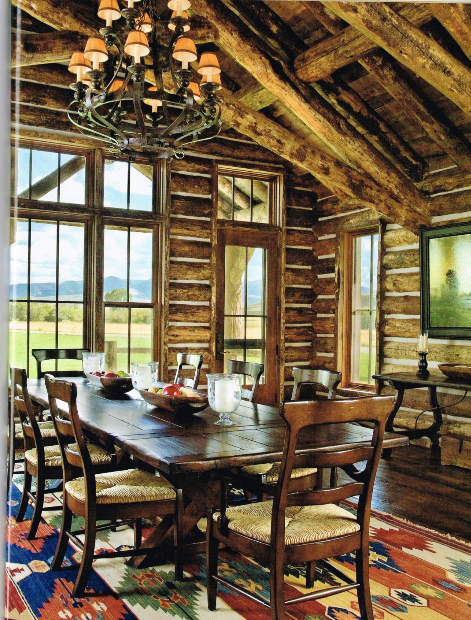
OPPOSITE: A trestle table made from old oak planks sits beneath an antique iron chandelier in the dining room. The owners requested a house that could comfortably accommodate up to 20 people at a time. The Portuguese-style side table is circa 1880. Floors throughout are reclaimed fir.